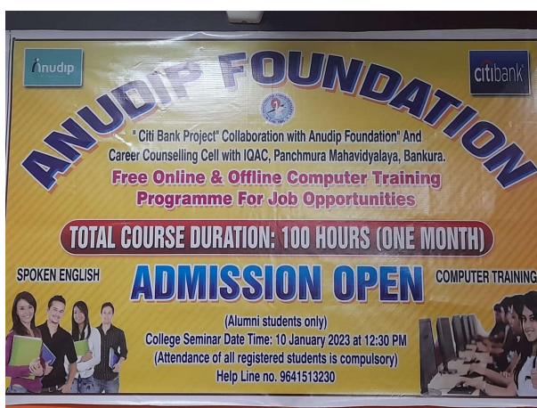
The Banner of the Seminar