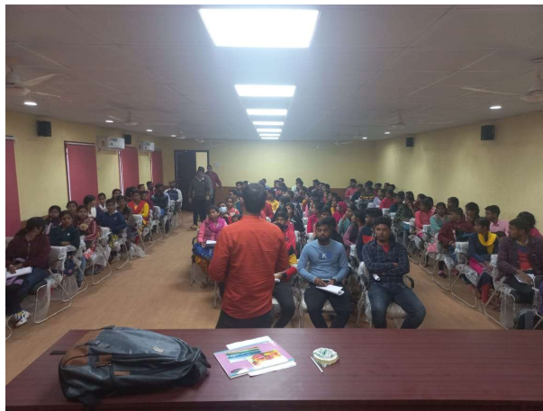
Participants with keen attention to the speaker